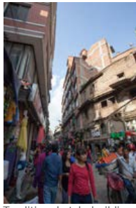
Traditional style buildings