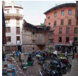
Behind the shrine of the lovely polygonal temple to Krishna