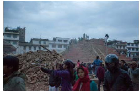
Kathmanduites roaming around Darbar Square