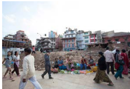
Flower sellers in front of the remains