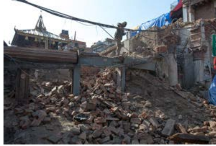
The demolishing of shopfronts in the compound of Janabaha Dyo