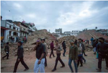
Kathmanduites walk dazed among the collapsed temples