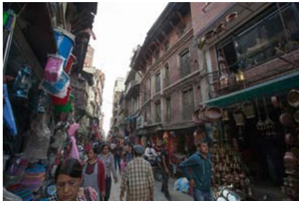
Between Asan tole and Indrachowk