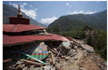
Collapsed gumpa in Simigaon Village

Back to Newar urban settlements main article