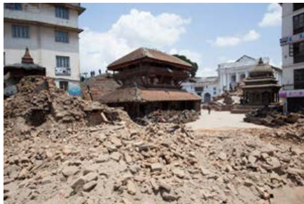
Standing in the middle of the ruins of Kasthamandap