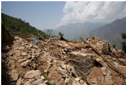
Wide stone/mud mortar home in ruins