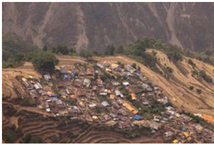
Destroyed village homes in S. Gorkha district