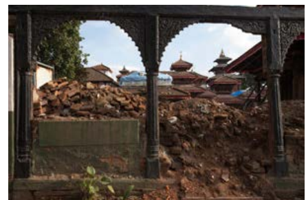
Palace Armory (the Kot)