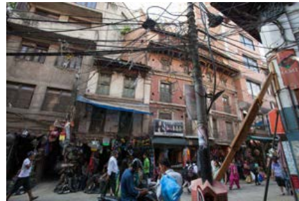
Along the bazar route