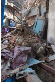
Damage at Janabaha Dyo