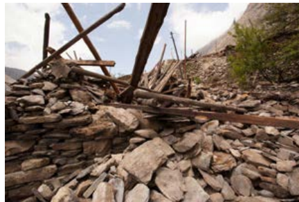
Destroyed homes made from stacked stones