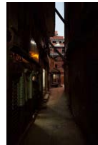
Chwas Pakha Tole