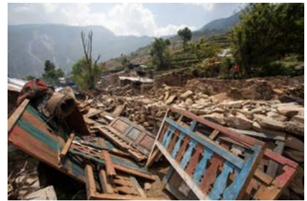
Homes destroyed in Chhamchet Village