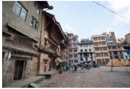
Yatkha Vihara and square