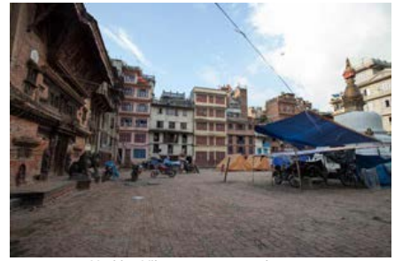
Yatkha Vihara, square and stupa