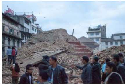
Kathmandu Durbar Square