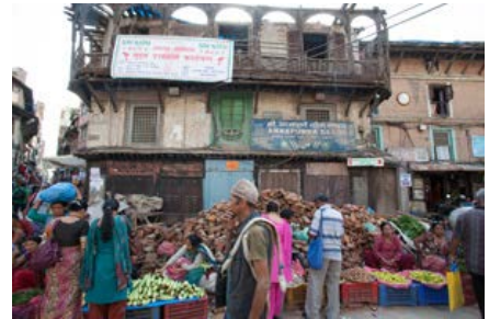
Asan Tole damaged building