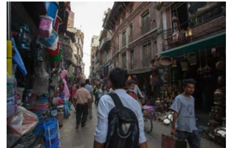
Between Asan tole and Indrachowk