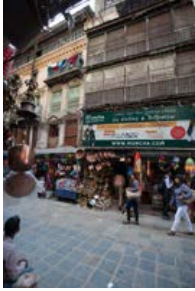
Traditional style buildings