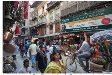
Traditional style buildings