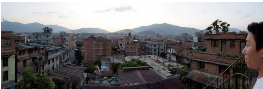
Gagan Kansakar, gazes out over the construction of the New Rose Garden