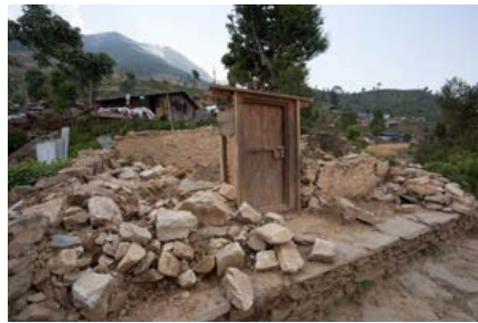
Single standing village home, Chhamchet Village