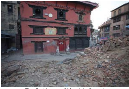
The God house of Marutole Ganesh