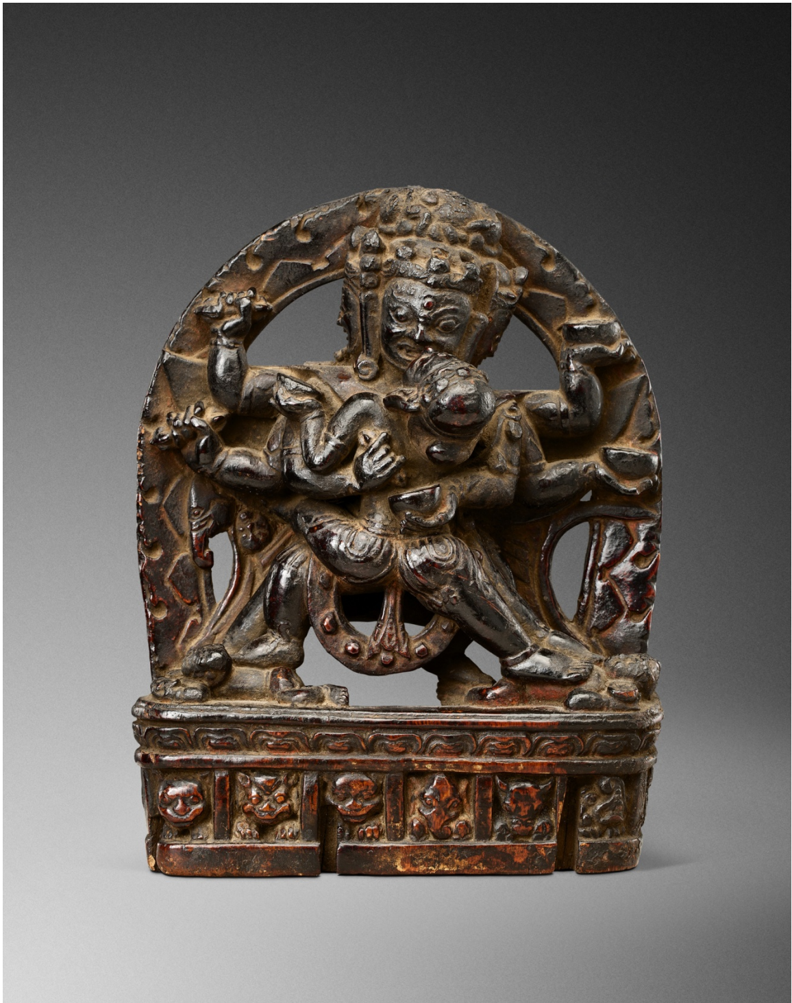
13 - Heruka Hard Wood Height: 17,5 cm 13 th century Tibet