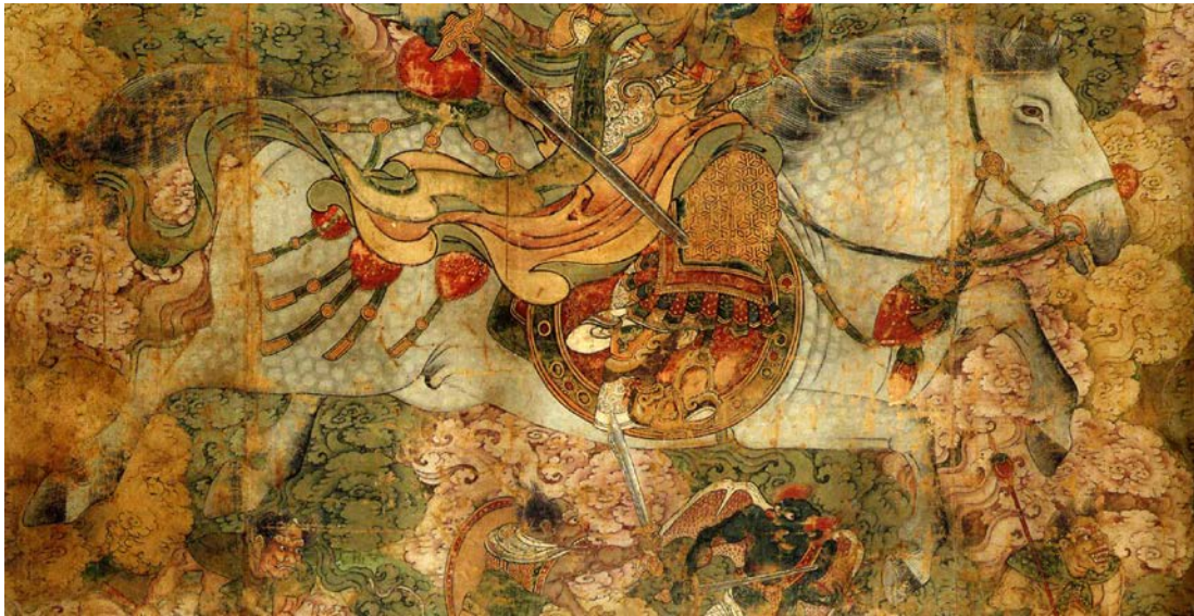
Fig. 2: Wisdom and Compassion, the Sacred Art of Tibet, Kubera, cat. 45, p.163

These fittings adorned horses back and were located behind the saddle. Some thangkas show how they were displayed (see Fig. 1 and 2). Such complete sets, from 14-15th century are extremely rare, and no similar works seem to have been published yet.