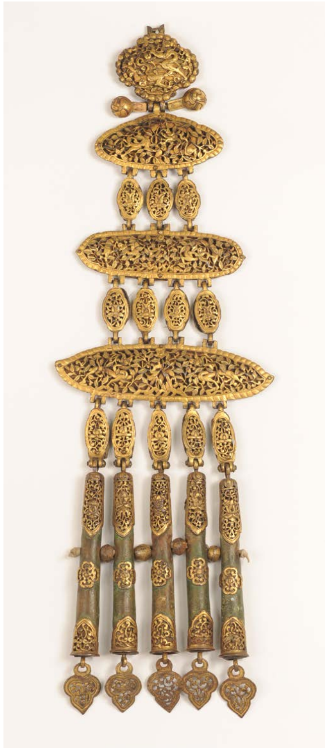
6 - Pair of Horse Fittings Gilt iron, wood, skin-fish Height: 65 cm 14-15th c. Tibet or China