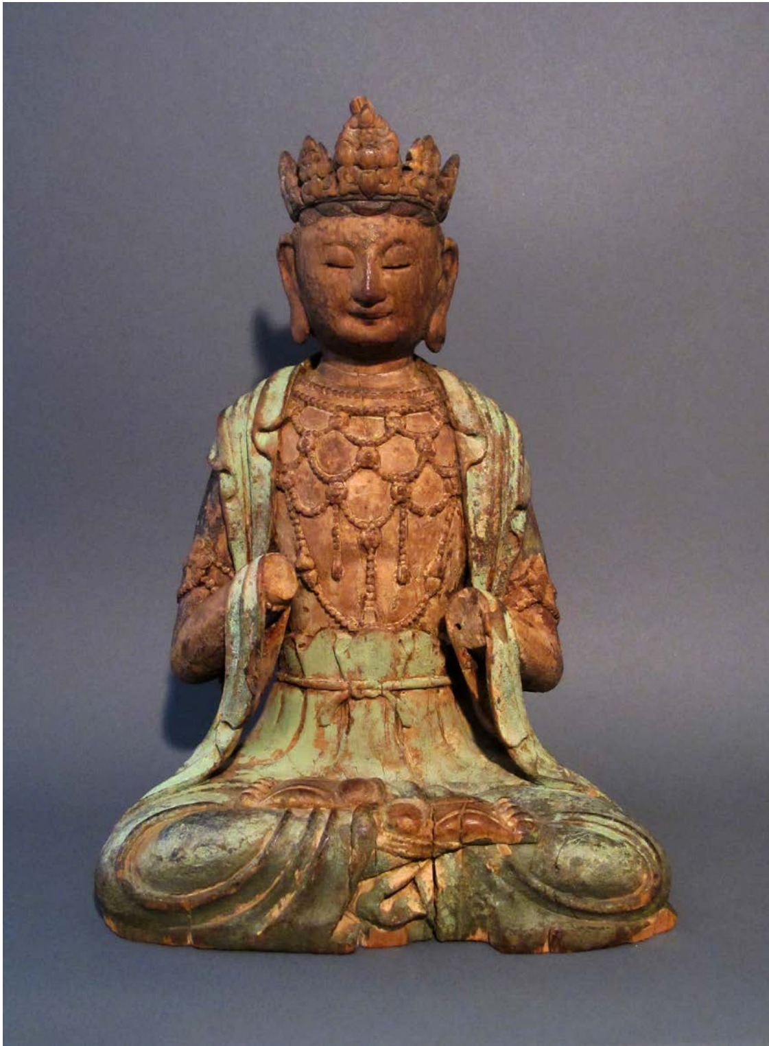
4 - Sitting Buddha or Bodhisattva Polychrome wood Height: 31,5 cm Yuan dynasty (1279 -1368) China