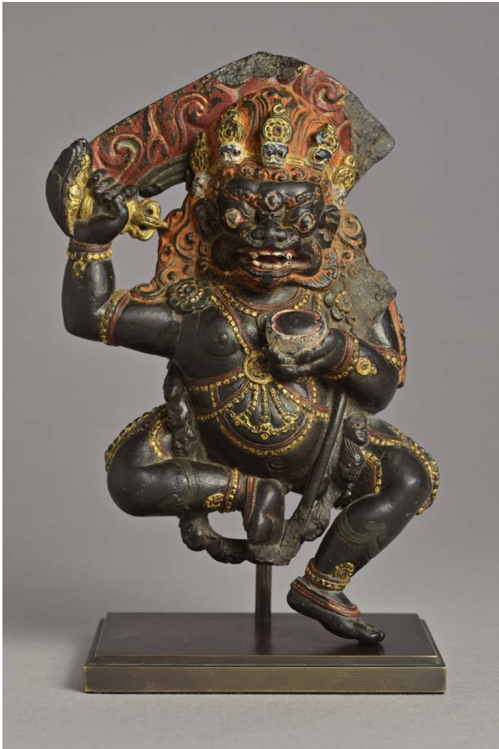
5 - Simhavaktra Black stone Height: 17,3 cm 14 th century Tibet