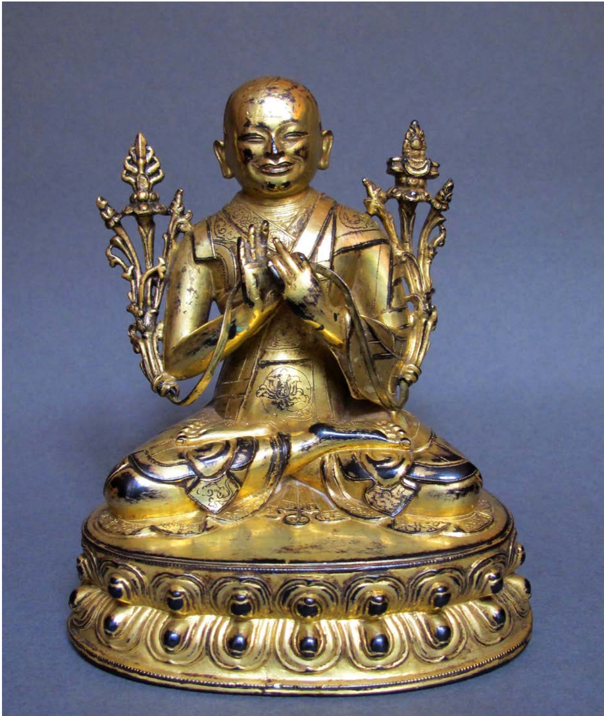
1 - Lama Gilt bronze Height: 13,5 cm 15th century Tibet