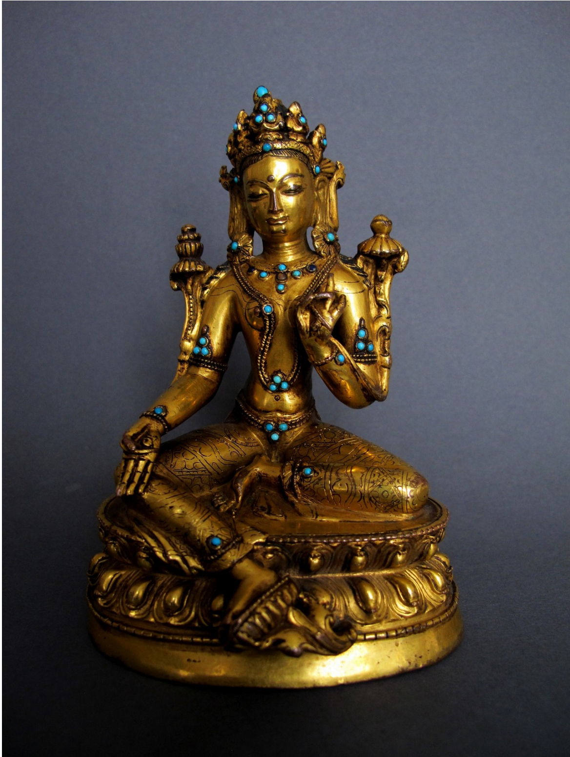
10 - Syamatara Gilt bronze Height: 12,2 cm 16th century Tibet