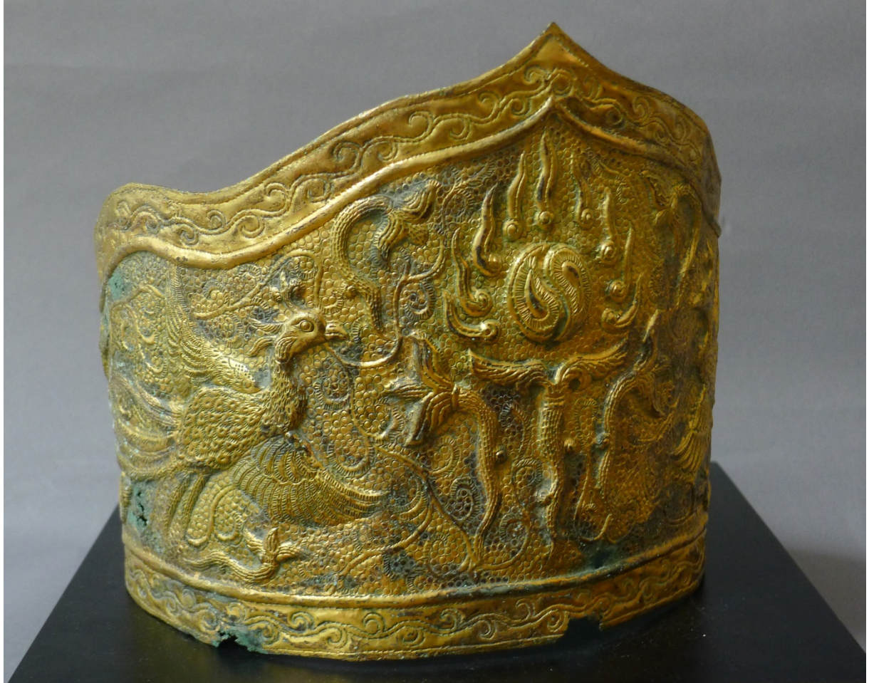
12 - Crown, Pair of phoenixes flanking a flaming gem Gilt copper repoussé Height: 18,5 cm Liao Dynasty, 10 th -11 th century China